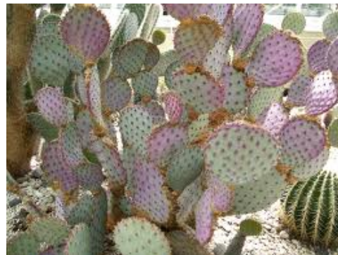
American Desert - Cactus