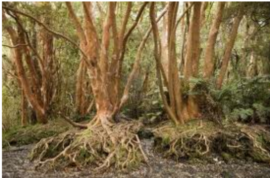
Rainforest - Mangrove